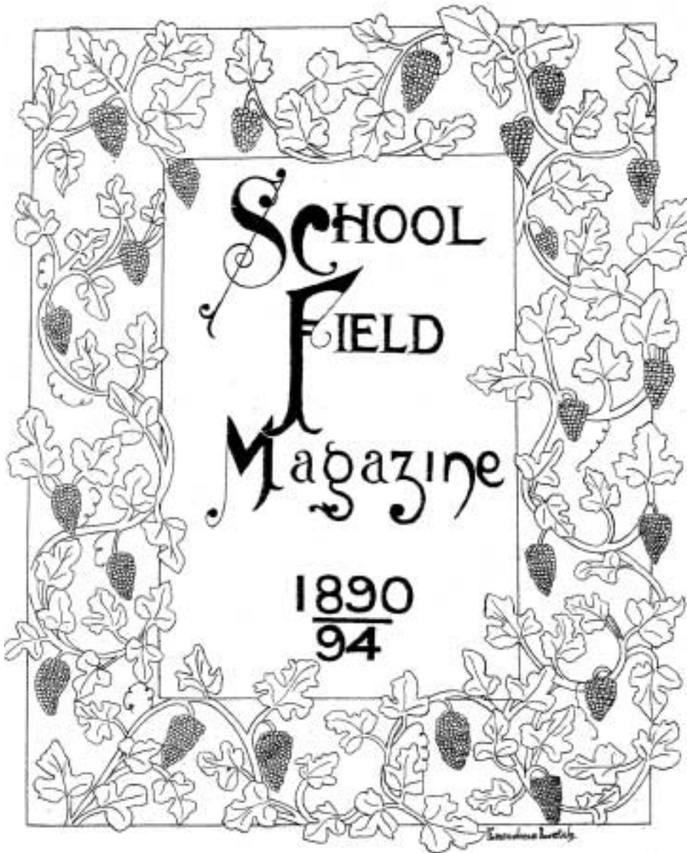
Figure 1. School Field Magazine: title page.

decided to accept the new tenant. 6 Such was the school's end. Let us now briefly turn to its beginning and to its historical and local context.